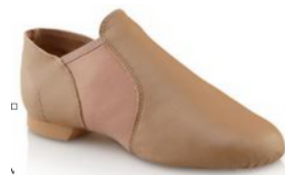
Tan Jazz Split Sole Slip On

Each genre requires a different shoe and all students must have the correct footwear for classes as well as for any performances. The specific style of shoes used at MSD can be found on record at Stage zone in Werribee when you let them know you are from Magenta's School of Dance.