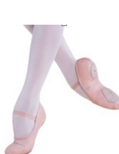
Ballet Split Sole Pink