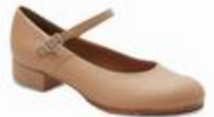
Tan Tap Shoe